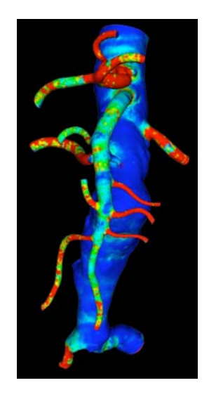
Wall shear stress from imagebased aorta model, obtained by E. Bekkers in Taylor lab